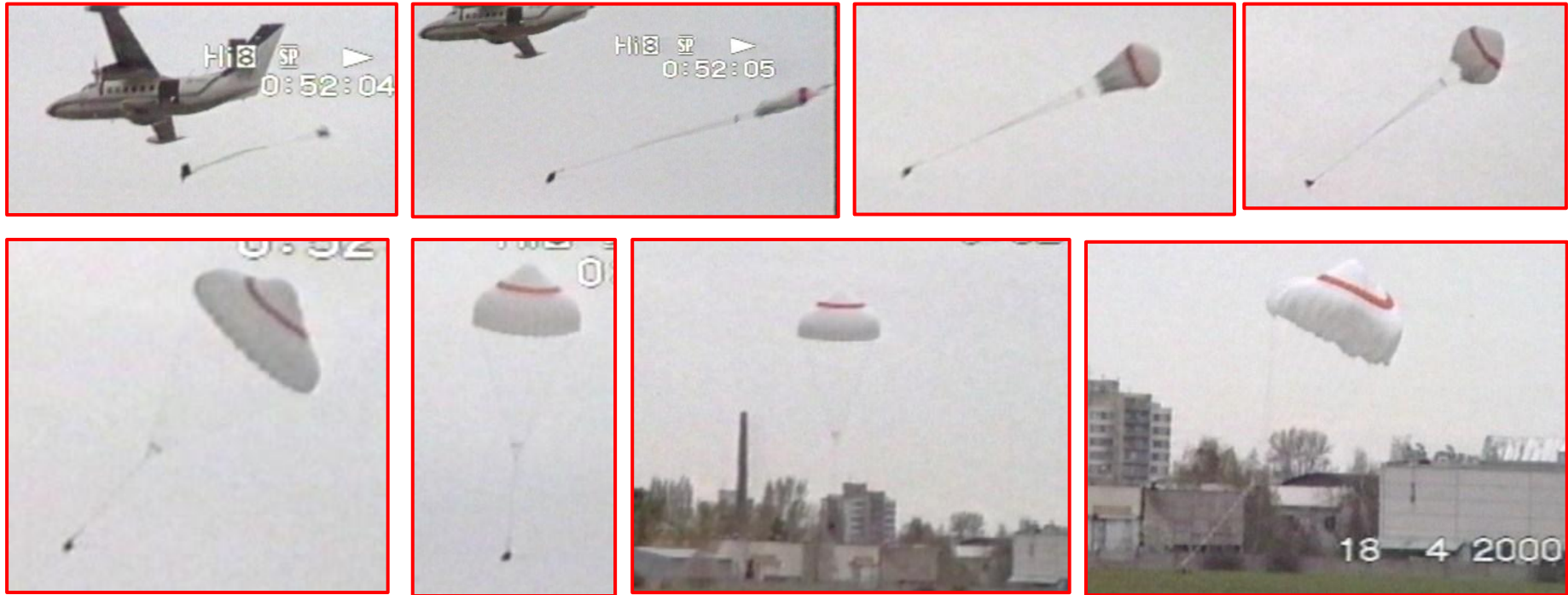
USH 52 S softpack V_i = 305 \text{ km.h}^{-1} , G_z = 502 \text{ kg}